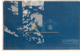
© Catherine Reinhardt, 2013 award winner

The Art Museum of Eastern Idaho (TAM) has championed the visual arts since 2002 through innovative and stimulating exhibits and its focus on educational art programs.